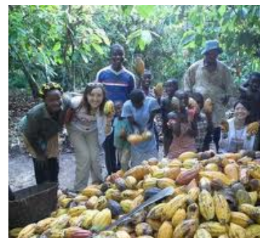
The happy farmers with harvest

Choco-Revo!, founded in Japan in 2006, has planted more than 60 thousands of Cocoa seedlings from nurseries in Ghana. We are recognized as an official project of Cocoa Board, which is under Ghana government controlled to promote organic agro-forestry in the name of biodiversity and forest protection. From the season of 2013 we would begin a collaborate project with European chocolatiers,